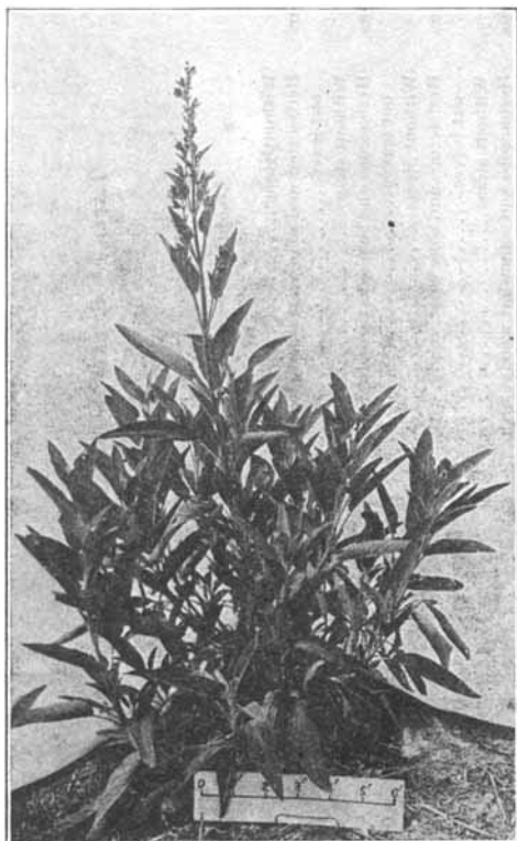
Fig. 2.— Salvia officinalis L. Cultivated plant, showing bushy habit of growth.

leaves of samples collected in Maryland and Virginia, was below the limit of tolerance of 1 percent. This is quite likely explained by the fact that the material was collected in late summer or fall. Material collected in Wisconsin yielded higher amounts. Since these leaves also, as far as we could learn, were collected